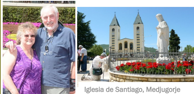
Iglesia de Santiago, Medjugorje