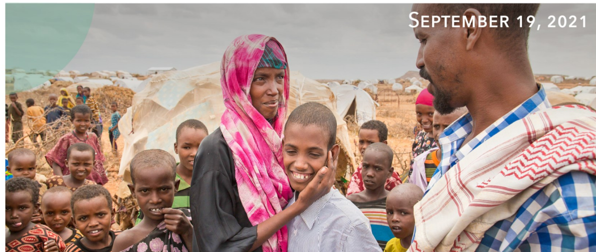
Migrants and Refugees Section/Vatican