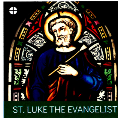
ST. LUKE THE EVANGELIST

Dearest St. Joseph, at the word of an angel, you lovingly took Mary into your home. As God's humble servant, you guided the Holy Family on the road to Bethlehem, welcomed Jesus as your own son in the shelter of a manger, and fled far from your homeland for the safety of both Mother and Child. We praise God that as their faithful protector, you never hesitated to sacrifice for those entrusted to you. May your example inspire us also to welcome, cherish, and safeguard God's most precious gift of life. Help us to faithfully commit ourselves to the service and defense of human life —especially where it is vulnerable or threatened. Obtain for us the grace to do the will of God in all things. Amen.