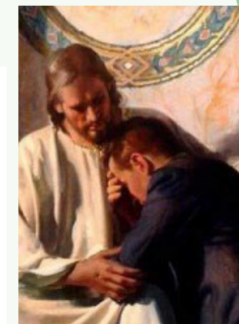
February 20, 2022

301 E. Francis St. Molalla, OR 97038 | 503-829-2080 | stjamesmolalla957@gmail.com