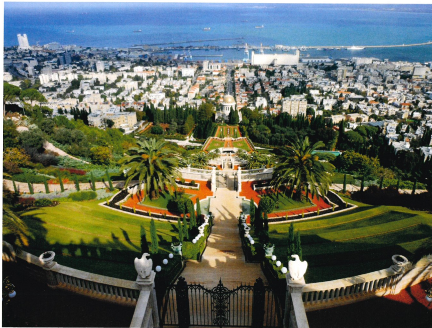
Tel Aviv * Haifa * Caesarea * Nazareth * Cana * Tiberias * Sea of Galilee * Jordan River * Mt. Tabor * Jerusalem * Gethsemane * Bethlehem * Masada * Jericho * Dead Sea * Mt. of Olives * Mt. Zion * Holy Sepulchre

Roundtrip from Portland International Airport (PDX), OR. Additional departure cities available upon request