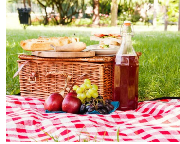
Parish Family Picnic