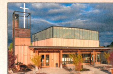
Hosted by St. Edward Catholic Church