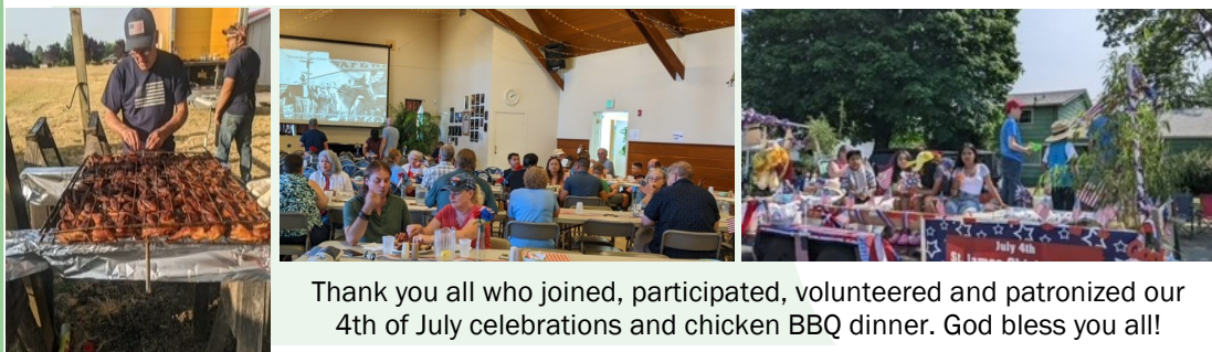
Thank you all who joined, participated, volunteered and patronized our 4th of July celebrations and chicken BBQ dinner. God bless you all!

Our Knights of Columbus men are in charge of cooking but they can always use help with serving and selling meals. Contact Scott Scofield (262-960-5717) for more information.