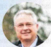
REP. ED DIEHL