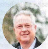
REP. ED DIEHL