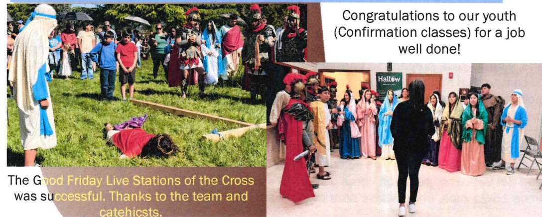
The Good Friday Live Stations of the Cross was successful. Thanks to the team and catechists.

Congratulations to our youth (Confirmation classes) for a job well done!