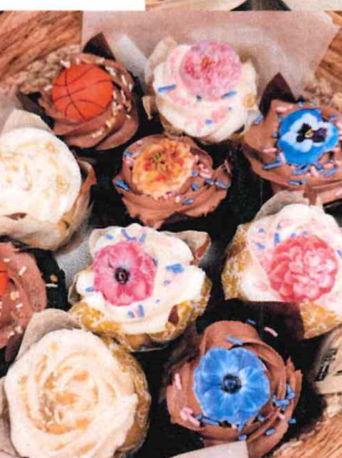
A real dessert for your eyes as also for your sweet tooth cravings.