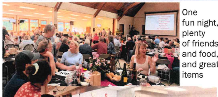
One fun night, plenty of friends, and food, and great items