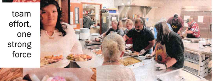
team effort, one strong force